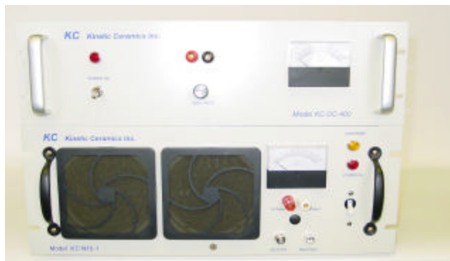
KCI Drive Electronics, 1000 Volts, 1500 Watts

Fast operation requires a high-bandwidth and high-power amplifier that can rapidly charge and discharge the piezoelectric actuators. The Model KCN15-1 KCI power supply produces 1500 watts and 6.3 Amps peak at 1000 volts with a bandwidth of 15,000 Hertz. The external bias voltage adjustment enables input drive signal to be centered at zero volts while keeping the output drive voltage always positive.